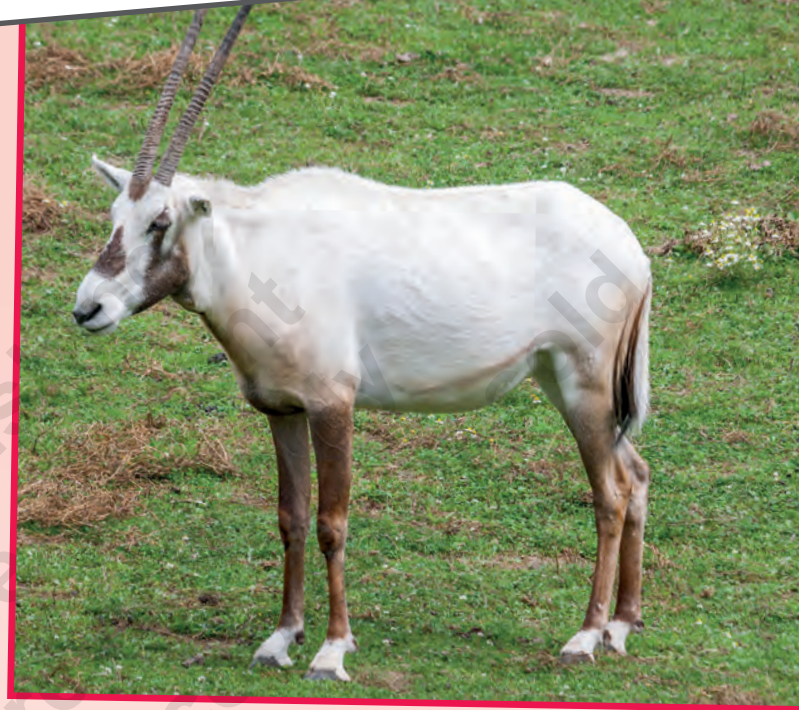
The Arabian Oryx: Qatar's National Animal

This meant that there were only Arabian oryx in zoos. But now, things have changed. There are over 1,000 wild Arabian oryx in the Middle East. There are even two natural reserves in Qatar. These are large areas of land where animals can live peacefully.